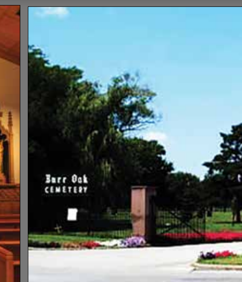
Saint Benedict Cemetery (top) ... Burr Oak Cemetery (below right) ... Queen of Heaven Mausoleum Chapel (below left)